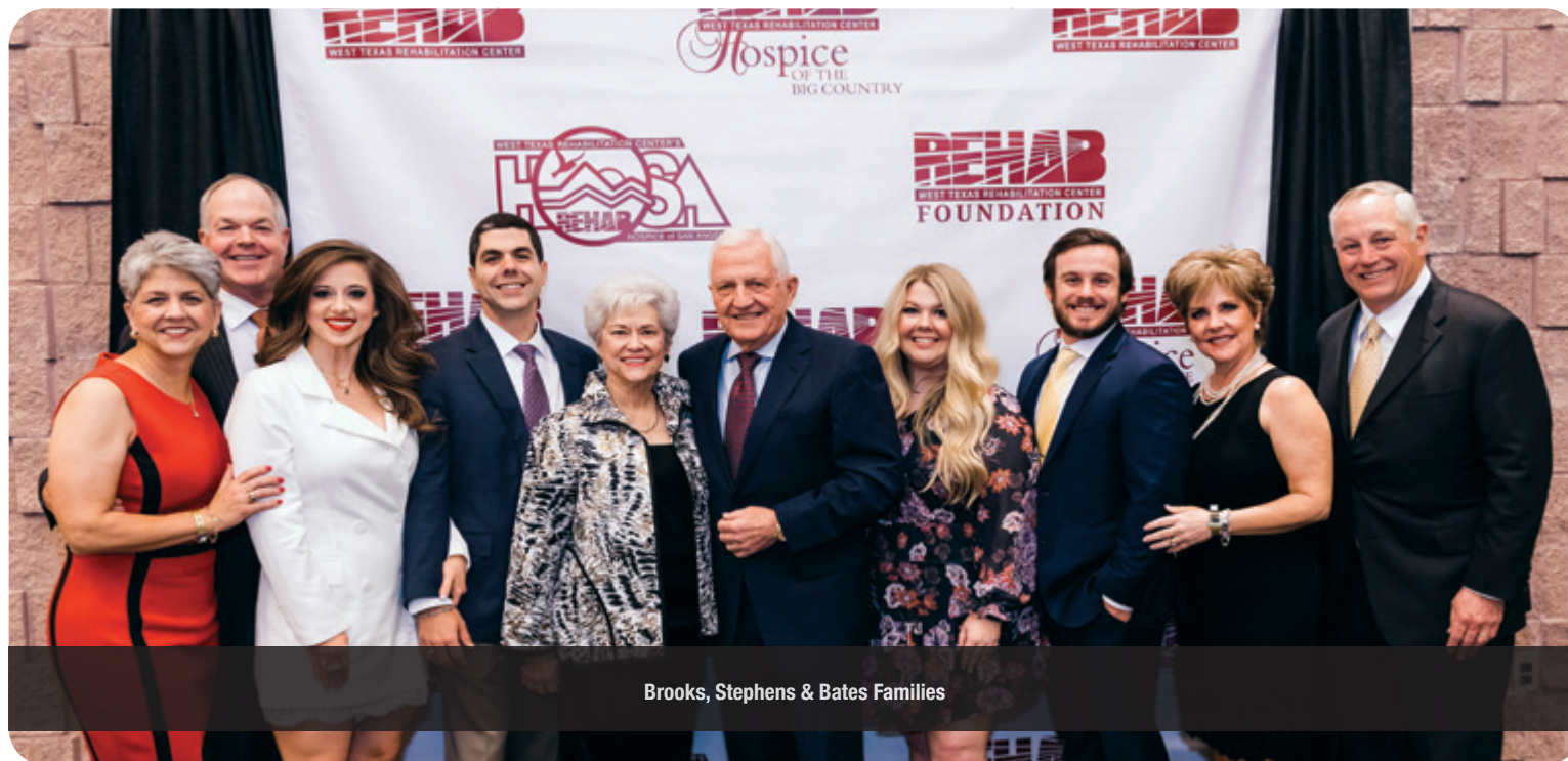
Brooks, Stephens & Bates Families