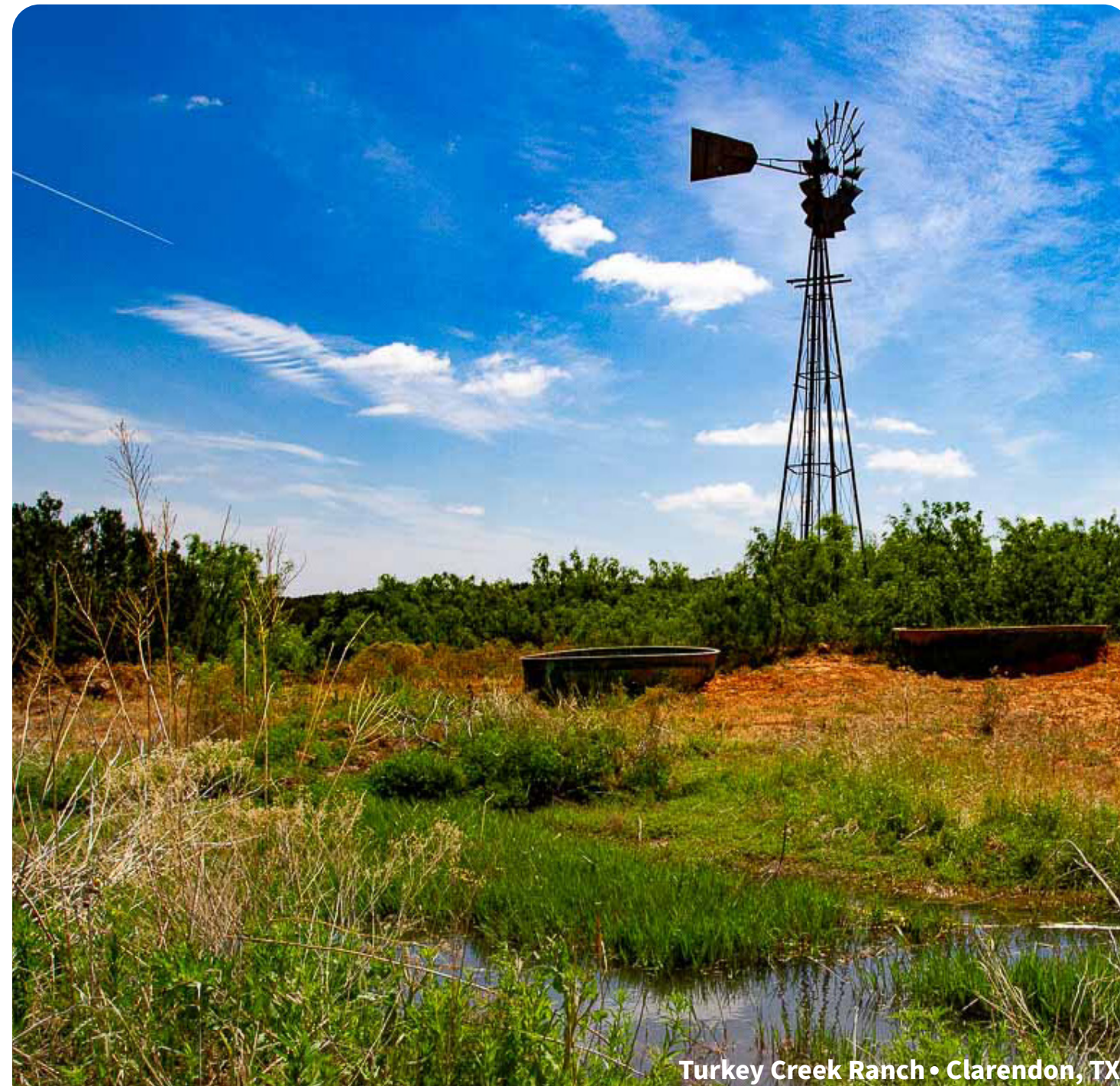
Turkey Creek Ranch • Clarendon, TX