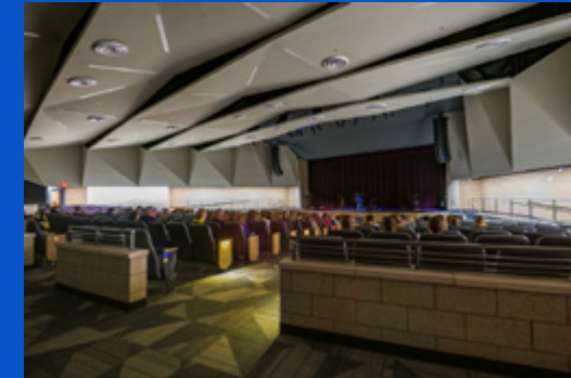
Wylie High School Performing Arts Center

RHS Construction Services focuses on commercial construction including new construction and remodels.